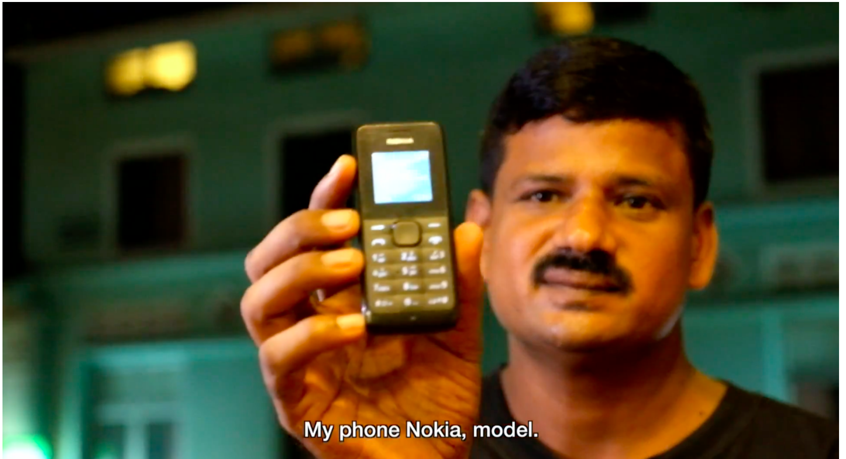
My phone Nokia, model.

That's when the 2G network will be shut down, but more than 130,000 users are still on it.